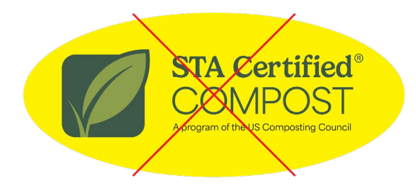
Do not use with unapproved colors.