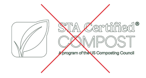
Do not outline.