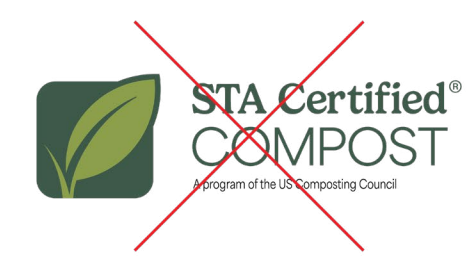
Do not change the spacing.