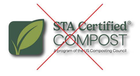
Do not add a drop shadow.