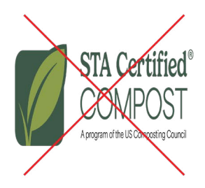
Do not stretch or squeeze.