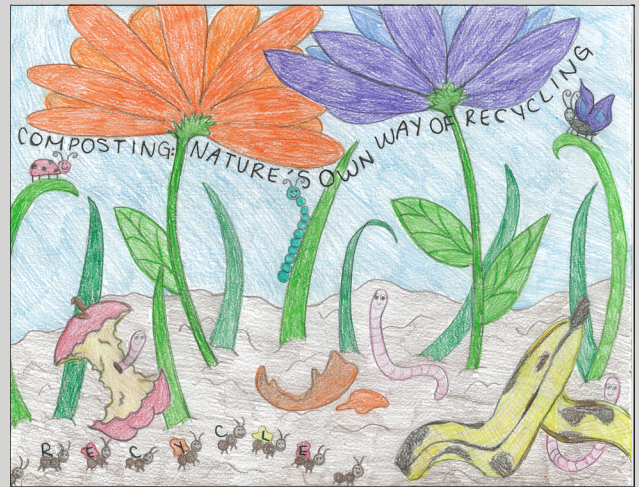
Grandprize Artwork by Zoë Asztalos

See how the High Country Composting Facility collects and processes locally generated organic waste and sells it as compost. The facility has been in operation since May of 2008 and has processed over 28,100 tons of feedstock. While this program began as a way to process a substantial amount of wood waste from mountain pine beetle kill, it has become the solution for managing organics collection throughout Summit County. Then, visit The Living Classroom (TLC), a