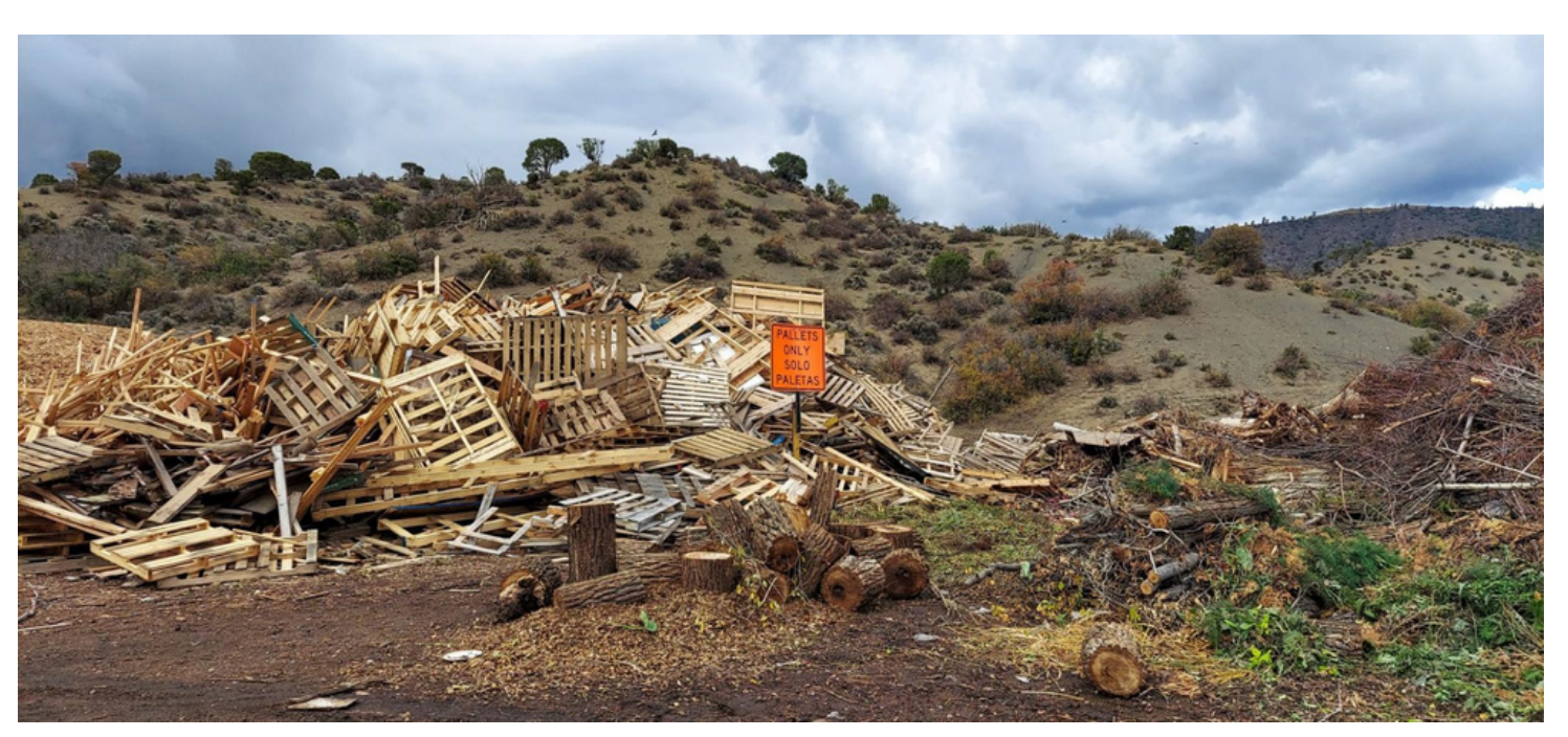
Pitkin County Landfill: Pallet sorting pad. VertSites 2023.

Eagle County Solid Waste and Recycling, Glenwood Springs's South Canyon Landfill, and the Pitkin County Waste Center all use this strategy.