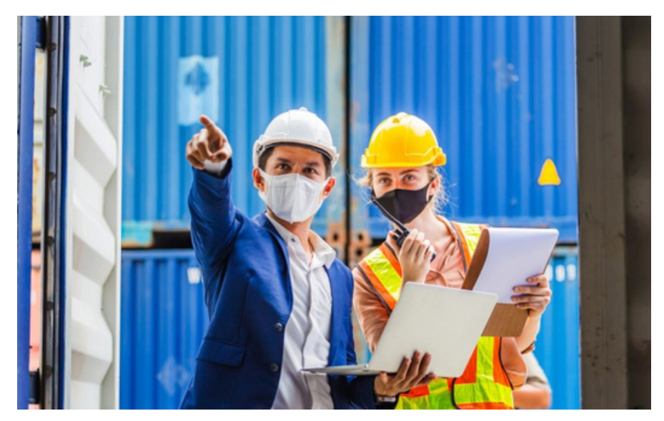
5 Common Environmental Hazards in the Workplace safetymanagement.eku.edu/blog.

<u>Mold</u> can also be found in structures that have been flooded, have leaks, or other moisture issues. It is important to properly evaluate a site before deconstructing it. It is also necessary to always wear PPE and to have a safety plan in place.