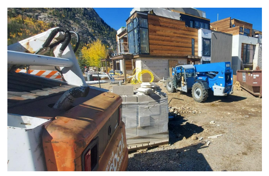
Multi-family home construction project in Frisco, CO. VertSites 2023.

Acquire data for materials that are being diverted to other processors for recycling or recovery, and if those markets will be available indefinitely. For example, in Summit County, Peak Materials (a local, private business) accepts concrete, asphalt, dirt, and other aggregates for environmental reclamation projects, as well as for repurposing and selling to the public. However, the backfilling operation is expected to be complete by 2028-2029, so the Summit County Resource Allocation Park must be prepared to accept more concrete, asphalt, and other aggregates at that time.