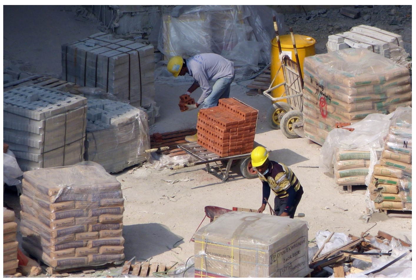
Typical Chemical Hazards Present On A Construction Site hseblog.com

Any paint applied earlier than 1978 could contain lead. One can test the paint to confirm the presence of lead or assume that there is lead and conduct work incorporating the <u>EPA-recommended safety practices</u>.