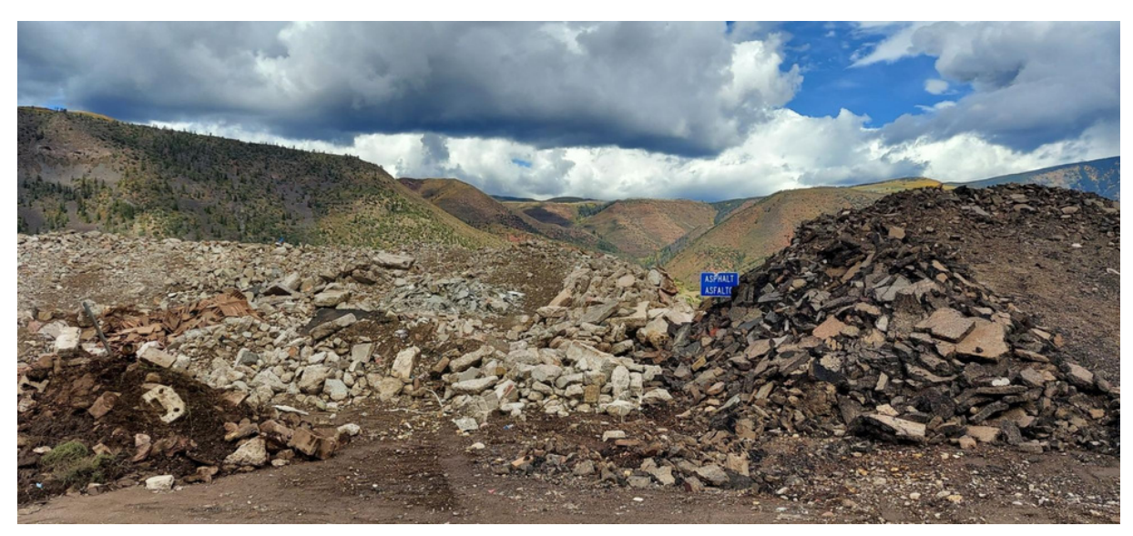
Pitkin County Landfill: asphalt & concrete sorting pads. VertSites 2023.

<u>Pitkin County</u> has a deposit-refund system requiring a minimum 35% diversion rate on all projects and separation of select materials. Projects pay a deposit of $1000 per ton of estimated trash which allows projects to reduce the deposit amount if they aim for a higher diversion goal. Projects track their materials in Green Halo and must submit their data to apply for a refund and be eligible for a final building inspection.