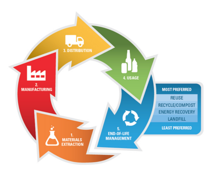
EPA Sustainable Materials Management Diagram