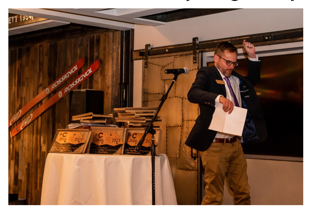
When Your Composting Bill Passes