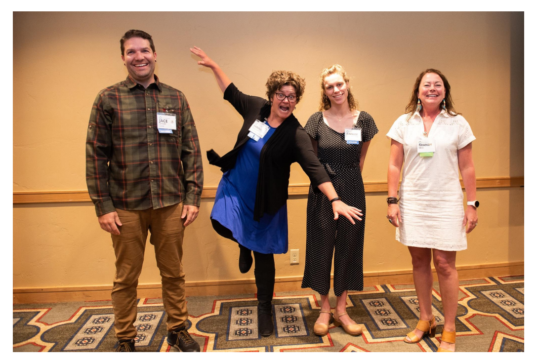
Get excited for some Compost Updates!