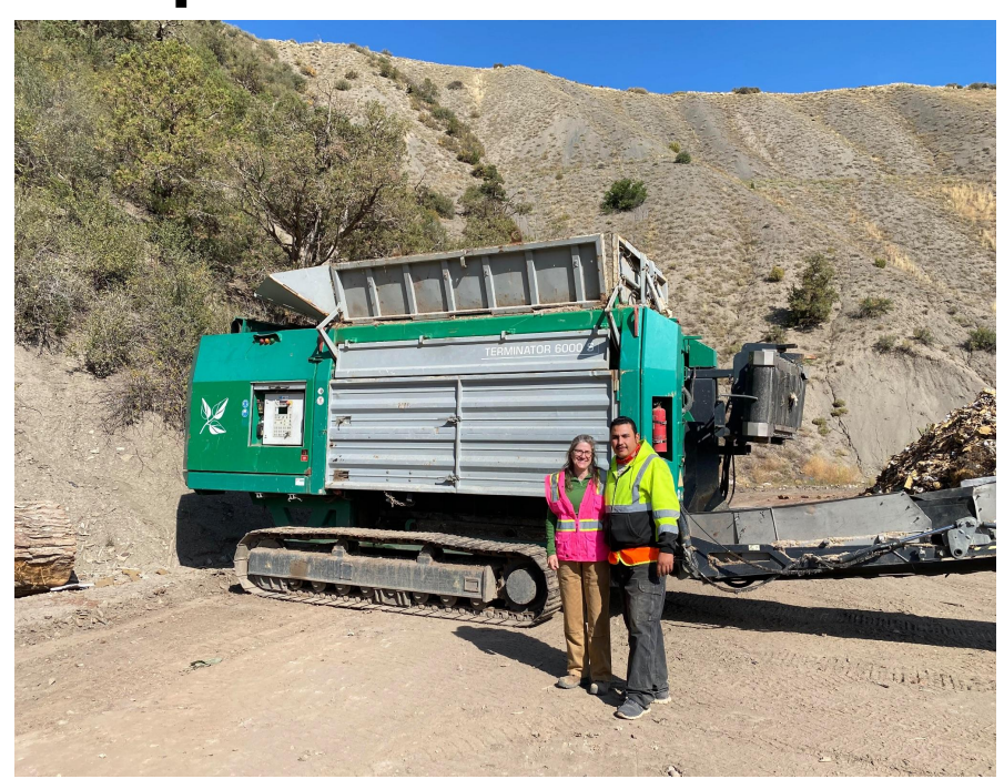
Western Slope Recycling in Action